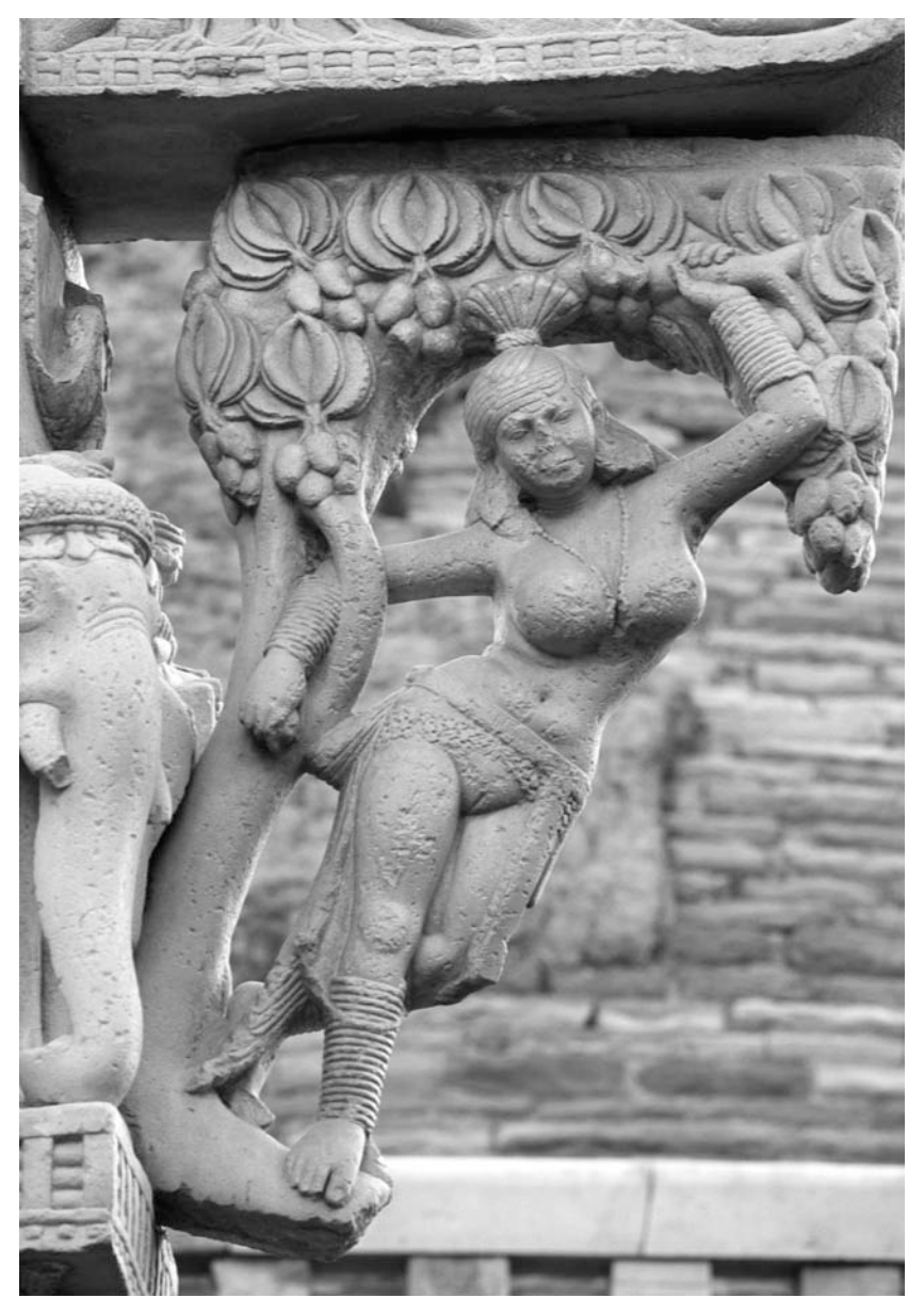
Figure 4.4 Detail of yakshi on East Torana of Great Stupa, Sanchi, India, ca. 1st century BCE-1st century CE. Image used with permission.