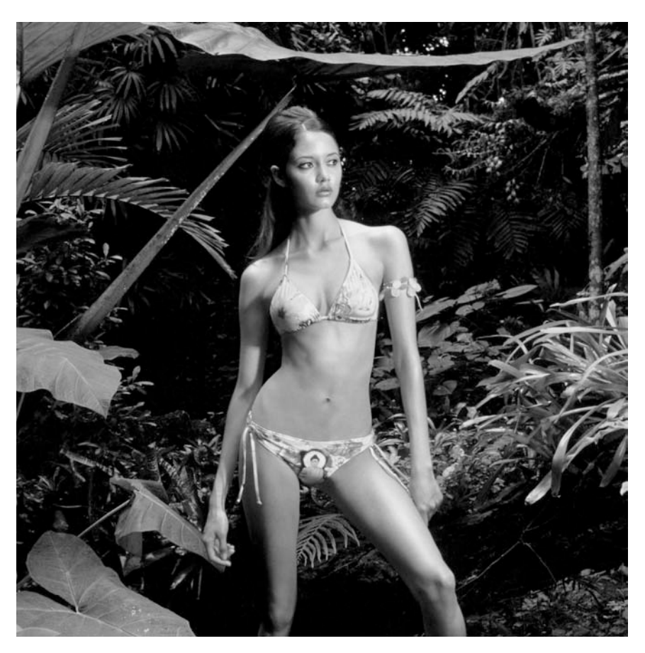
Figure 4.1 OndadeMar's "Baby Buddha Bikini." Image used with permission.

whom chimed in with their fellow Buddhists about the "tactlessness" and "orientalism" of the suits and the offending company. Employing the internet as a source for protest, Buddhists worldwide launched a campaign against Victoria's Secret.<sup>3</sup> Against the growing barrage of criticism, the company discontinued the line, though they did not offer a recall of the sold products, and were initially hesitant to offer an apology to those who were upset by the Buddha bikinis. Indeed, in a public statement the company denied knowledge that the image on the suit was indeed "the Buddha," and proceeded to pass the blame to the manufacturer, a Columbian company called OndadeMar. OndadeMar, in turn, discontinued its own version of the Buddha bikini, which it called the "Baby Buddha Bikini" (Figure 4.1), and promptly removed all offending images from its website (www.ondademar.com).