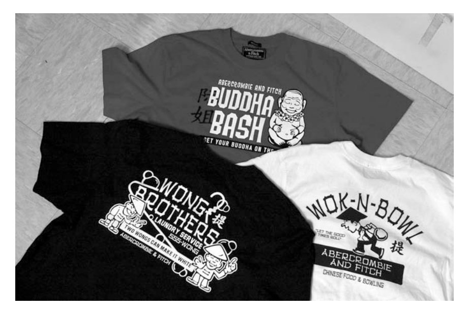
Figure 4.2 Detail of Abercrombie & Fitch's "Buddha Bash" t-shirt. Image used with permission.

The Buddha bikini was not, in fact, the first case in which commercialized images of the Buddha were the cause of controversy in the USA. In early 2002, trendy retailer Abercrombie & Fitch got into hot water for its new line of Asian-themed T-shirts, one of which was festooned with a stereotypical image of a pudgy Buddha wearing what (inexplicably) appears to be a Hawaiian lei, along with the words "Buddha Bash: Get Your Buddha on the Floor" (Figure 4.2).4