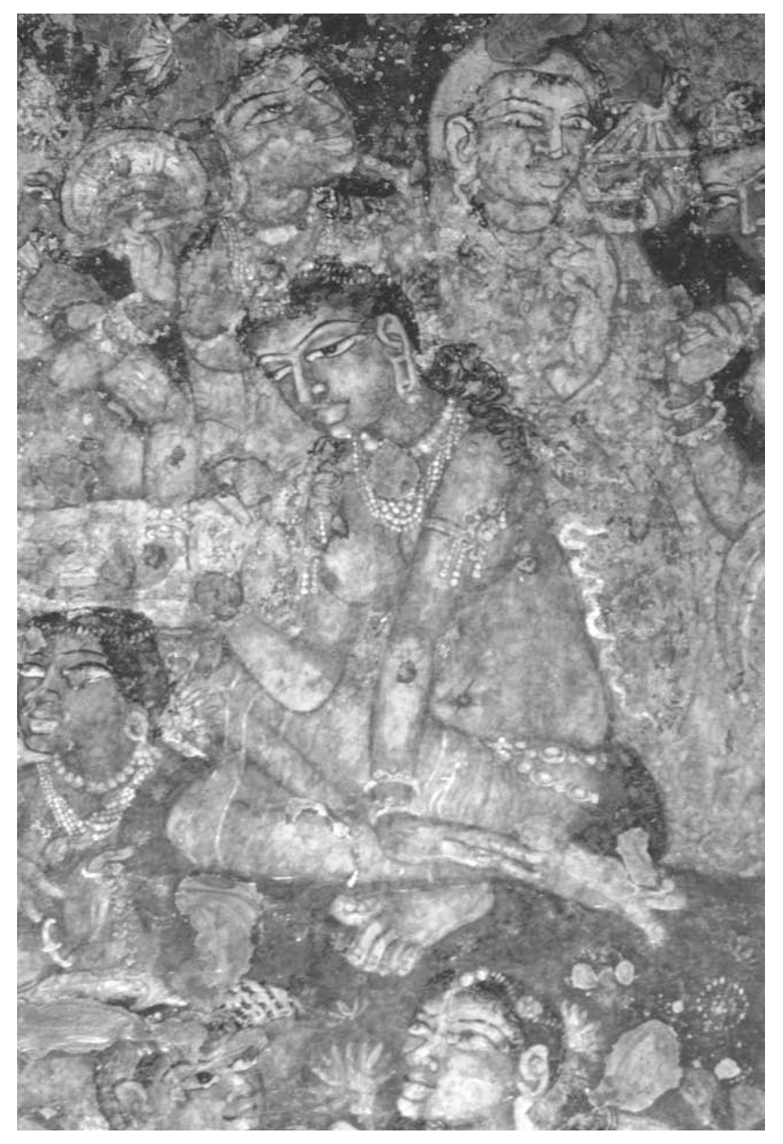
Figure 4.3 Detail of wall painting from the Ajanta caves, Ajanta, India, ca. 6th century CE. Image used with permission.