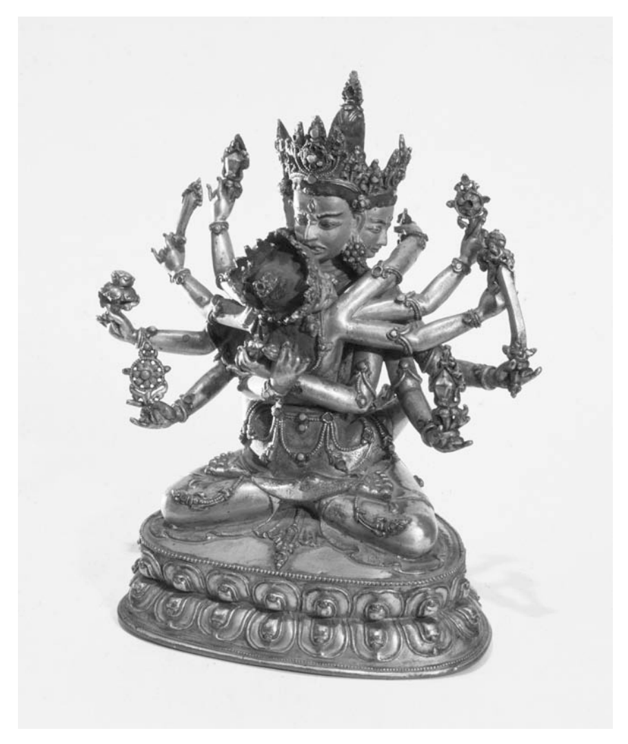
Figure 4.6 Kalacakra in yabyum embrace with Visvamata, 17th century. Image used with permission.

and recent studies of the use of religious motifs in US advertising indicate that, if anything, Western religions are more likely to be mocked or derided than their Eastern counterparts (Moore 2005).